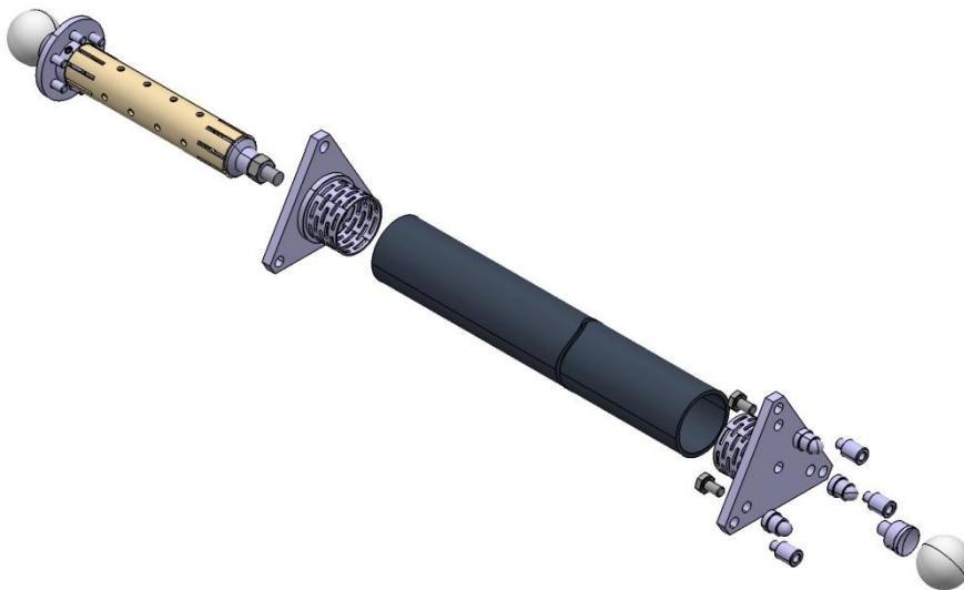
Figure 2: Design of modules 1 and 2.

Detailed design of modules 1 and 2 is shown in Figure 2.