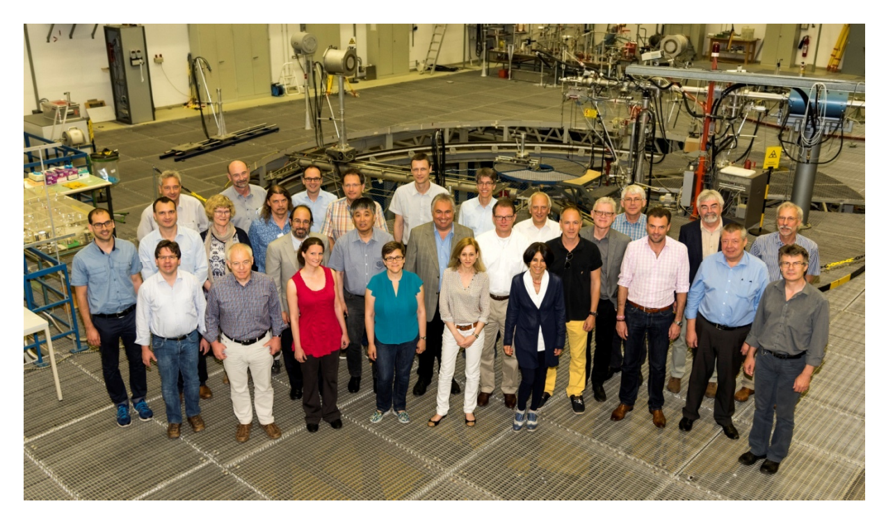
Figure 1: Photograph of participants in the experiment hall of the PTB Ion Accelerator Facility (PIAF).